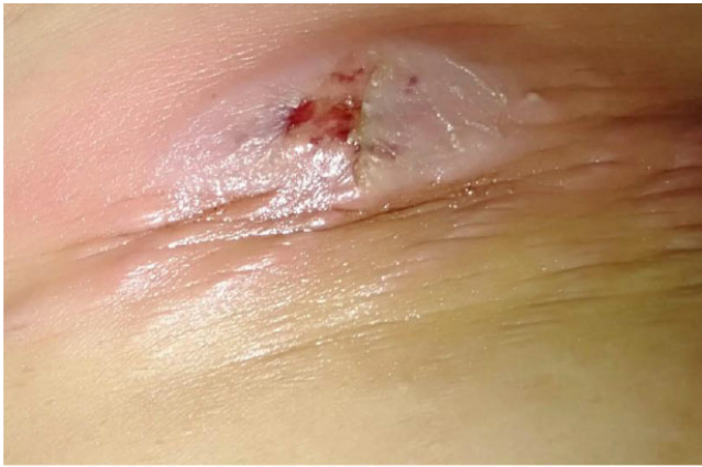
Figure 1. Erythematous painful solid lump on the right lower abdomen.